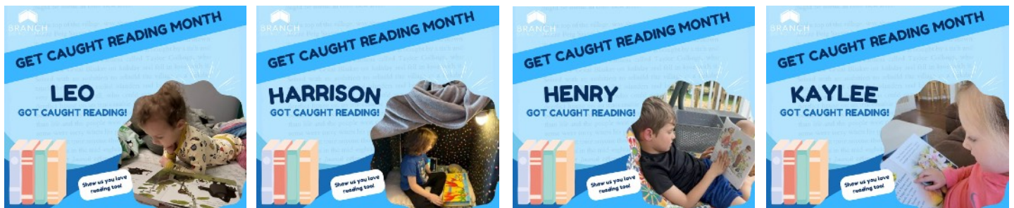
Some of our submissions for "Get Caught Reading Month"

The Daily Reporter shifted their Community Calendar online. They will no longer print a list of upcoming events in the paper. The paper focused on the Coldwater branch as they selected events to publish. We can now highlight events happening at all our locations and supplement our publicity.